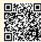
自動轉賬表格 Auto-payment form