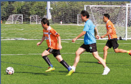
"Rehabilitate, Renew, Heart Together" friendly football match

Everyone who competes in the games goes into strict training. They do it to get a crown that will not last; but we do it to get a crown that will last forever. Therefore I do not run like a man running aimlessly; I do not fight like a man beating the air. No, I beat my body and make it my slave so that after I have preached to others, I myself will not be disqualified for the prize. 1 Corinthians 9:25-27