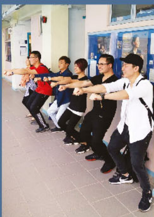
「青少年阿尼西母」到學校分享

從某一角度看，佔中事件雖然告一段落，但卻讓我們對青年人有更多的認識；希望這事不會使青年人心灰意冷而收藏起自己。