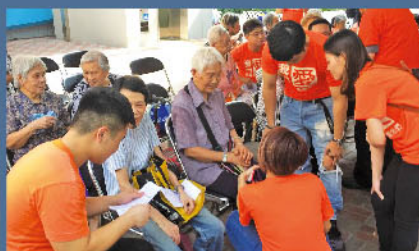
Participating in the volunteer service

The number of young people in correctional institutions in the past 10 years has continued to decrease, but this does not mean that youth are behaving better. This is because many judges tend to convict more youth with a bind-over order instead of sending them to prison, but the main reason is that many crimes committed