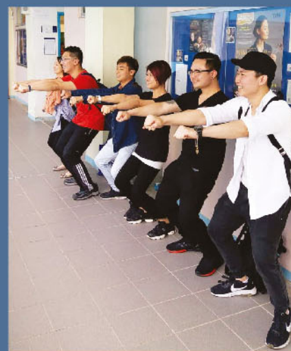
Members of Youth Onesimus make sharing at school

by youth that have been seen before are now hidden and have become difficult to see.