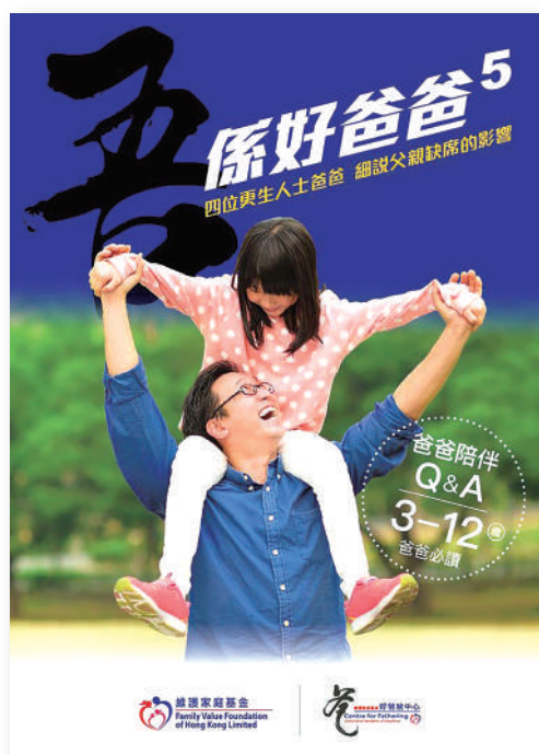
“I am/Not a Good Father 5” Testimonies of four rehabilitated person fathers.

Recently the School of Communication of Hong Kong Baptist University published a journal named “I am/Not a Good Father”. A group of professors with four students from writing majors interviewed four fathers that KSA recommended. It was about their experience as fathers. The publication was funded by the Centre of Fatherhood of Family Value Foundation of Hong Kong. For a publication that promotes how to be a good father. Its only natural to use “Good Father” in the name of the journal. But why use the old Chinese character of “I” which has the same sound as “not” in Cantonese, which means “Not a Good Father”? If my speculation is correct, I think the name “I am/Not a Good Father” was inspired by Luke 11:11-13. We will never be as good as a father to our heavenly father because of our weaknesses. But I think what Jesus said was more of an acknowledgment than judgment to earthly fathers. The Jews thought of God as a harsh judge, but Jesus proclaimed the good news of a God who is merciful, and we can understand how great and perfect God’s love is through the love of imperfect earthly fathers.